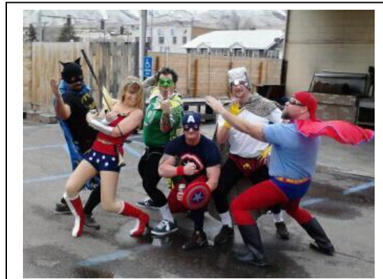
"SUPER HEROS" COSTUME WINNERS

As an added thank you, Volunteer Certificates and Prize Certificates are sent to each volunteer, prize sponsor and hole sponsor after the event is over.